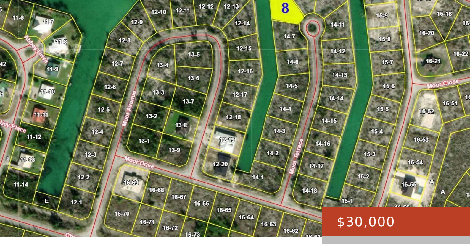
MOOR TERRACE https://bahamabeachrealty.com