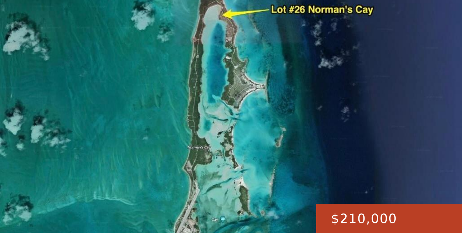
Lot #26 Norman's Cay