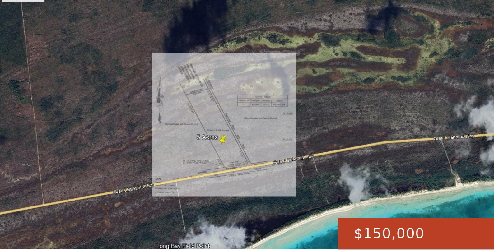
Long Bay Field Point