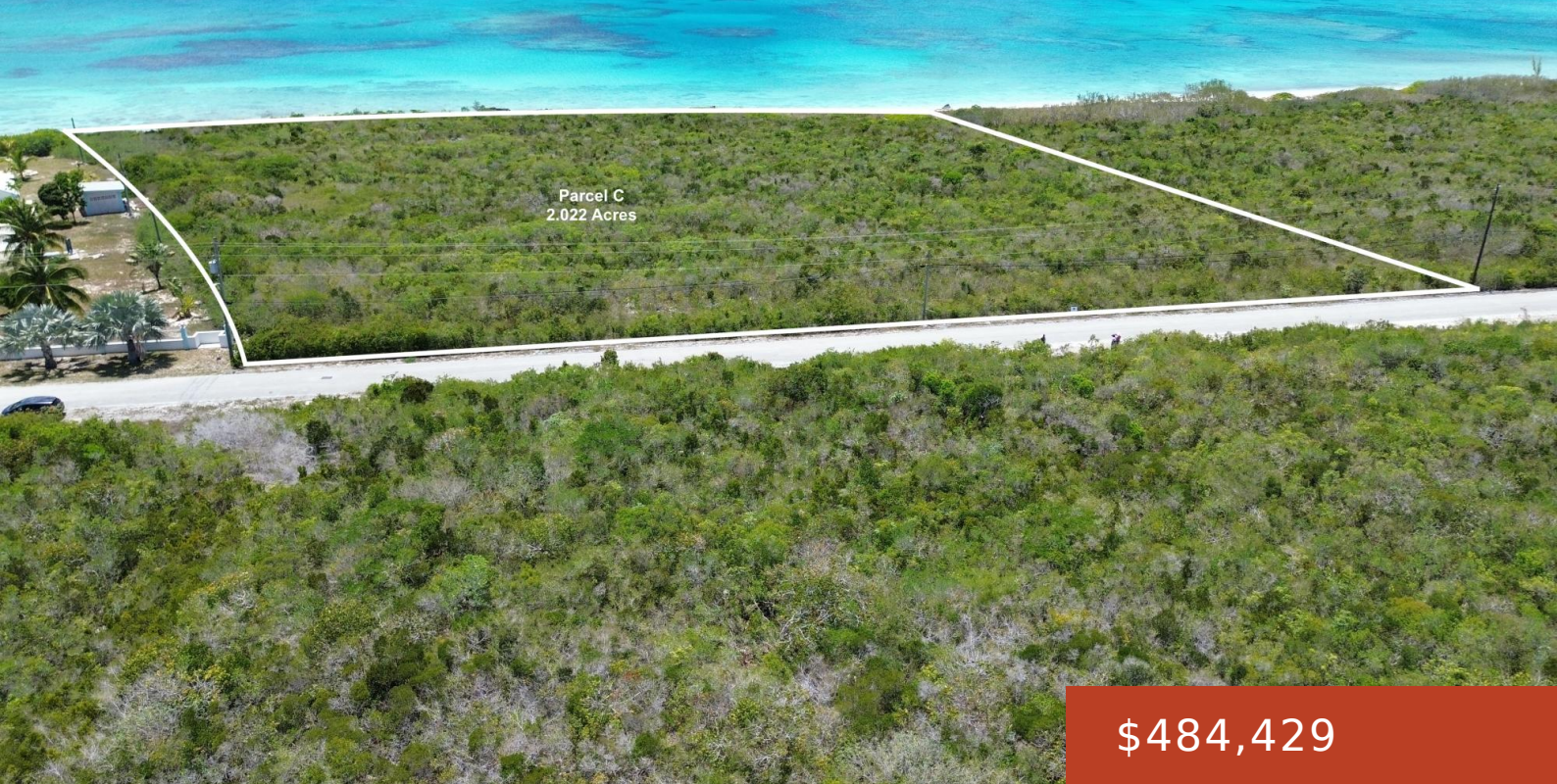
Parcel C 2.022 Acres