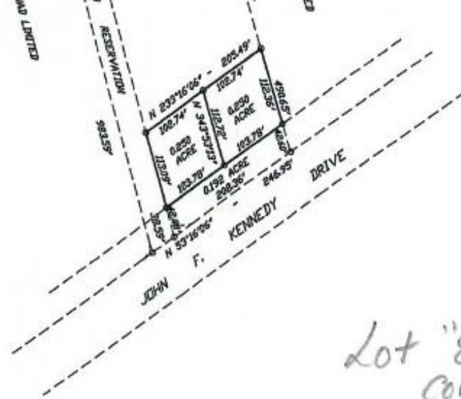
PLAN SHOWING SEVERAL PARCELS OF LAND