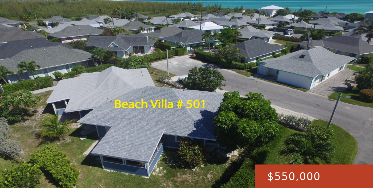
Beach Villa # 501